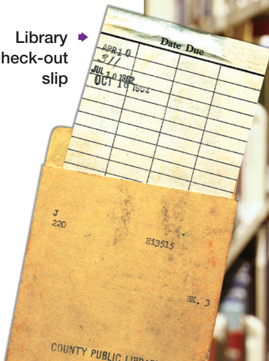
Library check-out slip ▶