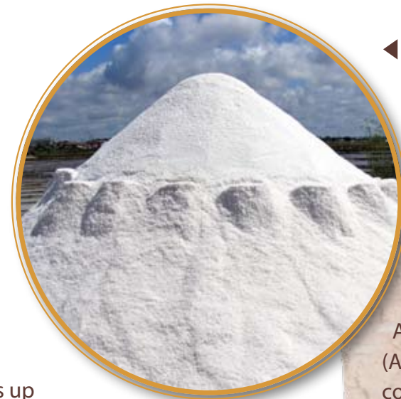
◀ Huge salt pile in Mali

Sundiata made an important decision for his empire. He chose to convert to Islam (is-LAWM). Once he became a Muslim, he was called Mansa Sundiata. The word mansa (MAHN-suh) means “emperor.” All of the Mali rulers were Muslims. The most famous Mali ruler was Mansa Musa (MOO-suh).