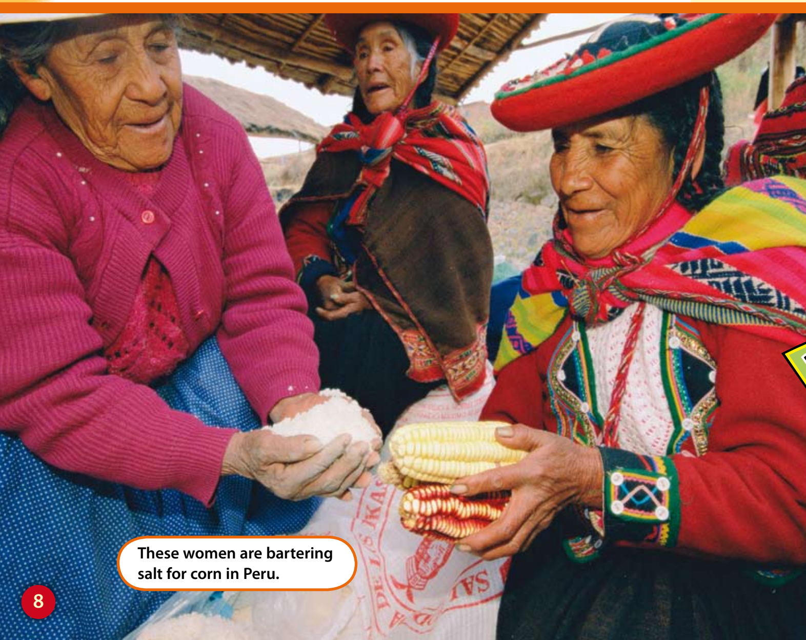
These women are bartering salt for corn in Peru.

People first traded by bartering . Bartering is where goods and services are swapped with each other. No money is used in bartering.