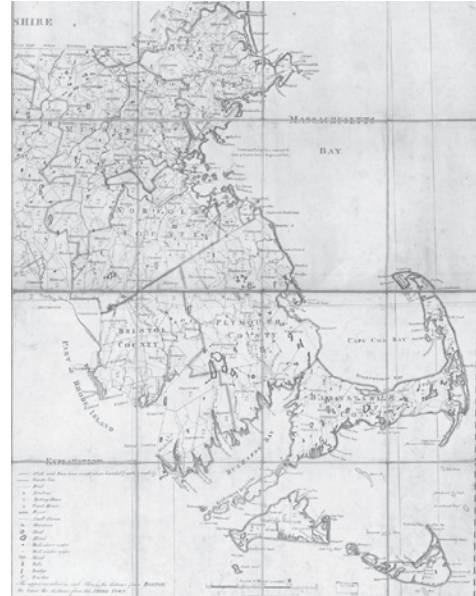
an early map of Massachusetts

Some people chose to come to America as servants. They worked for no money for a set period of time. After that, they were free to do as they wished. People were also brought to America as slaves. They worked on large farms, called plantations , in the South.